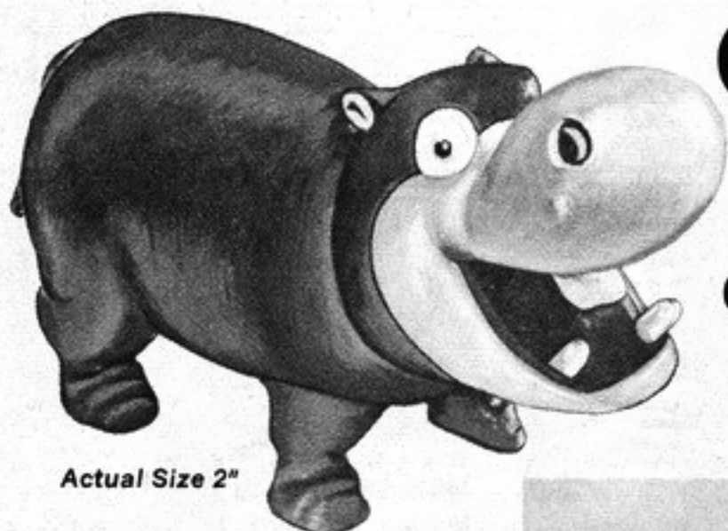
Actual Size 2"

Like Rick Ely NEXT ISSUE ON SALE DEC. 29 Be sure to get yours!