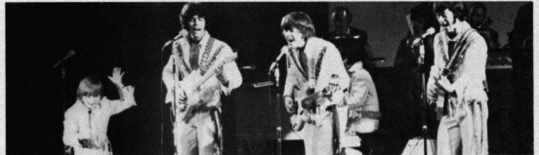
THE OSMOND BROTHERS television show didn't get great reviews but it did prove again how talented the boys are. Little Jimmy Osmond was a sure-fire scene stealer! The boys had a good show in Las Vegas too, and lots of fun!

formance by a Group: The CARPENTERS for "Close to You;" and Best Comedy Recording: none other than FLIP WILSON for "The Devil Made Me Buy This Dress"... You can look for MITCH VOGEL , beginning his second season in "Bo-