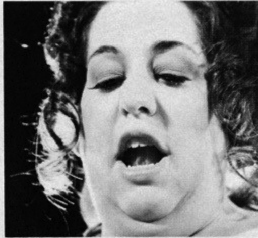
NEWS AROUND TINSEL town is that the Mamas and the Papas may become a singing group again—great!

it as a big joke. In case you missed out on the winners, some of the ones you might be interested in were: Record of the Year: "Bridge Over Troubled Water;" Album of the year and Song of the Year: "Bridge Over Troubled Water." Best New Artist: (for which your Partridge Family was nominated) The CARPENTERS ; Best Performance by a Female: DIONNE WARWICK for "I'll Never Fall In Love Again;" Best Performance by a Male: RAY STEVENS for "Everything is Beautiful;" Best Per-