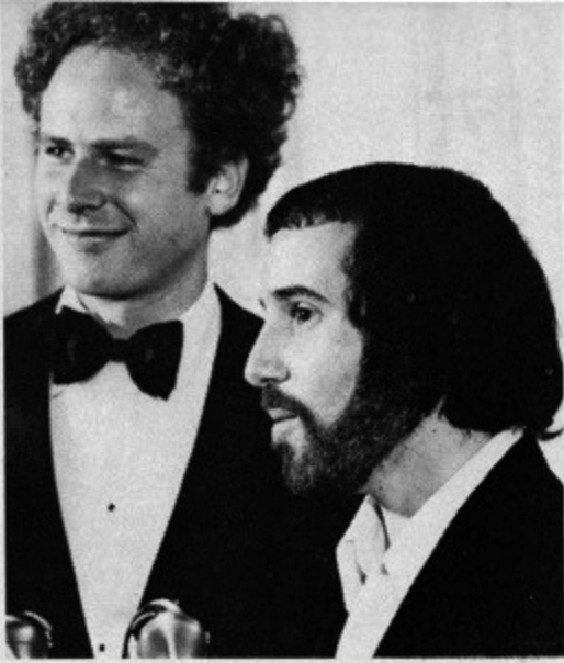
SIMON AND GARFUNKLE won many awards Grammy night for their hit song "Bridge Over Troubled Water."

pick up Grammys for himself, GEORGE and JOHN for music of "Let It Be." Nobody seemed to mind that PAUL was dressed casually for a formal affair and he wore white tennis shoes. He was awarded with a standing ovation as well as a Grammy. Also, if you missed the show, you also missed two of your favorites, DAVID CASSIDY and BOBBY SHERMAN who presented Grammys. DAVID , although somewhat nervous, managed to look and act in such a way that I suppose delighted his adoring fans everywhere, although the dialogue he and SHIRLEY JONES had was, well... That wasn't his fault, the writers did pretty badly on the whole show. BOBBY too, probably curled the toes of all his fans, but I must offer my congratulations to him on the fine cover-up job he did for NANCY SINATRA . He handled himself quite well. Somehow it seems that the awards telecasts are losing their splendor. It seems as though a lot of the "old-timers" take