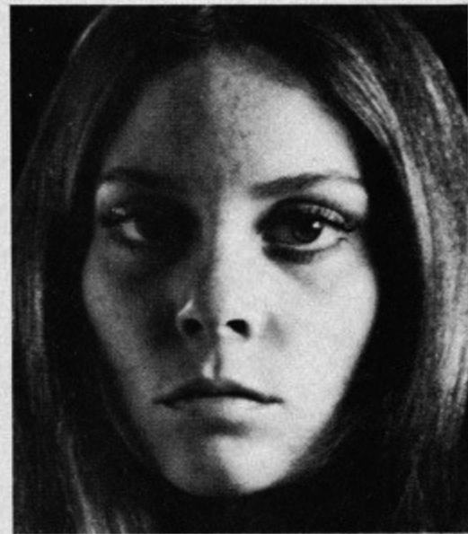
LESLEY WARREN has decided to drop from "Mission: Impossible" and so has Leonard Nimoy. Is it a trend?

pick up Grammys for himself, GEORGE and JOHN for music of "Let It Be." Nobody seemed to mind that PAUL was dressed casually for a formal affair and he wore white tennis shoes. He was awarded with a standing ovation as well as a Grammy. Also, if you missed the show, you also missed two of your favorites, DAVID CASSIDY and BOBBY SHERMAN who presented Grammys. DAVID , although somewhat nervous, managed to look and act in such a way that I suppose delighted his adoring fans everywhere, although the dialogue he and SHIRLEY JONES had was, well... That wasn't his fault, the writers did pretty badly on the whole show. BOBBY too, probably curled the toes of all his fans, but I must offer my congratulations to him on the fine cover-up job he did for NANCY SINATRA . He handled himself quite well. Somehow it seems that the awards telecasts are losing their splendor. It seems as though a lot of the "old-timers" take