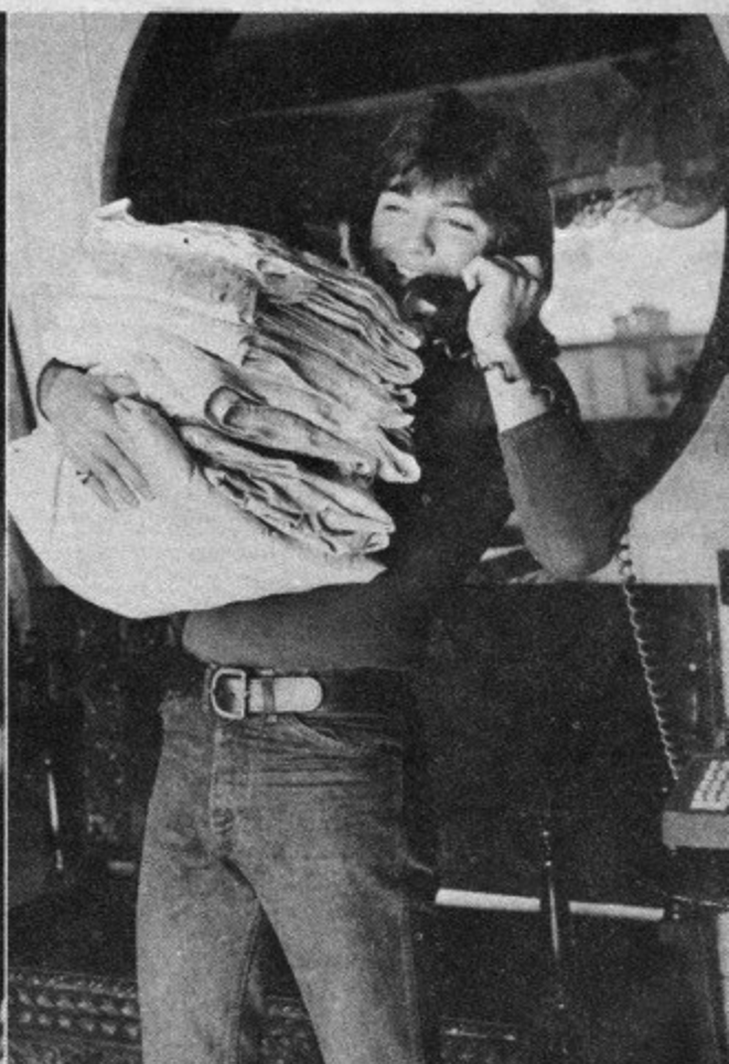
No sooner do I get the shirts put away and start to put the towels in the linen closet than the phone rings—"Hi, nope—sorry, you've got the wrong number."