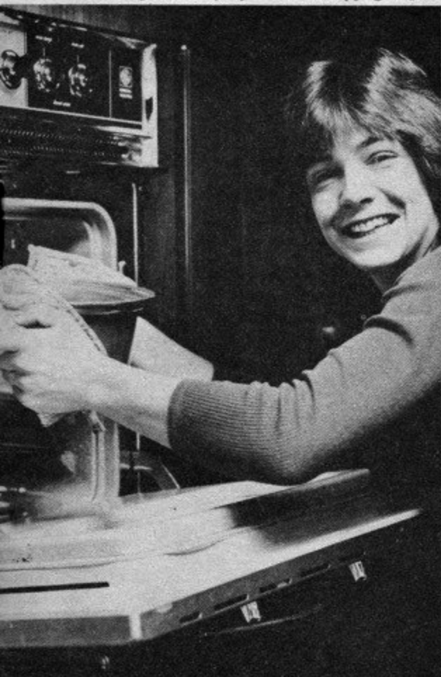
Next stop is the kitchen. Don't get any ideas—I still cannot cook, but I thought you might like to see how the oven works.