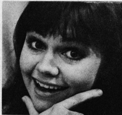
SALLY FIELD gave a great performance on the "Movie of the Week." This may open up new roles for her!

been offered three movie scores and title tune assignments from Universal but it isn't known whether or not he has the time for it, what with his busy superstar schedule... I hope you were able to see SALLY FIELD in her dramatic debut in "Maybe I'll Come Home in the Spring," a television premiere movie. SALLY did a great job and had good material to work with. If you didn't see it, watch for a rerun in the spring. The show's about a young girl who feels great suppression at home and runs away to communal living and drugs only to return a year later still searching for herself... Of course being partial to FaVE, I like to think that nobody can top their fabulous "Fly to Hollywood" contests, however, how about the one Karl's shoes is sponsoring? It's called, "Take a Walk with Bobby" (Sherman of course), and is going on in 17 states as a Karl's promotion stunt. If you're one of the lucky gals to live in a participating state you could win an evening in Hollywood with Bobby! ... PAUL McCART-