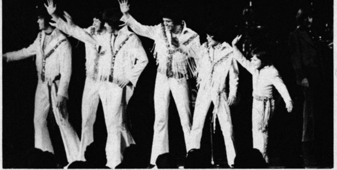
THE OSMONDS LOVE WORKING with big stars like Jerry Lewis and Nancy Sinatra whenever they perform in Las Vegas. They can't wait to do in-person concerts this summer all over the country, so they can meet fans!

The Osmond Brothers have already been called back four times to the super-sophisticated Caesar's Palace in