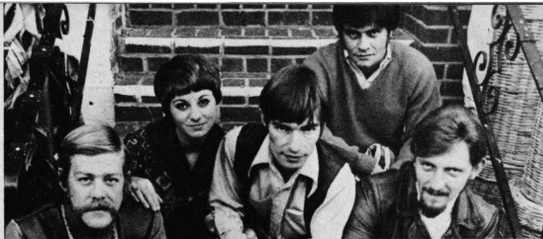
CHART-TOPPERS FROM CANADA are The Original Caste, a relatively new group on the record scene. They've had five hit songs in Canada and are eager to do the same in America. They're also very popular in Japan.