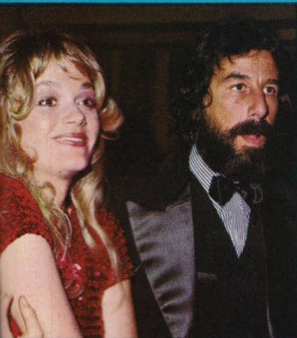
PEGGY LIPTON (with steady Lou Adler) flew in from Paris to attend Grammys. From there she took off for two weeks in Puerto Vallarta for a little more sun before returning for her fourth season with the "Mod Squad." How do you like Peggy's new hairstyle and thirties look? Lou has been her steady for 3 years!