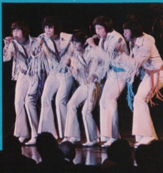
STARRING AT CAESAR'S PALACE with Jerry Lewis, The Osmonds stopped the show with their great songs and wild dance numbers! They sang "Everything is Beautiful" at Grammys.