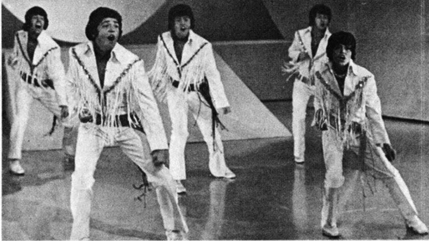
IN THIS WILD NUMBER from one of their specials, the Osmonds are wearing costumes identical to the one Elvis wore in his Las Vegas show!

monds special, had some exciting news too! They may have their own show which will run as a summer replacement for "Hee Haw," featuring young pop-country and rock talent. Watch for it—the TVer will be called "Young Country."