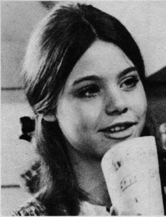
Thoughtful Susan Dey may be remembering some San Francisco memories!