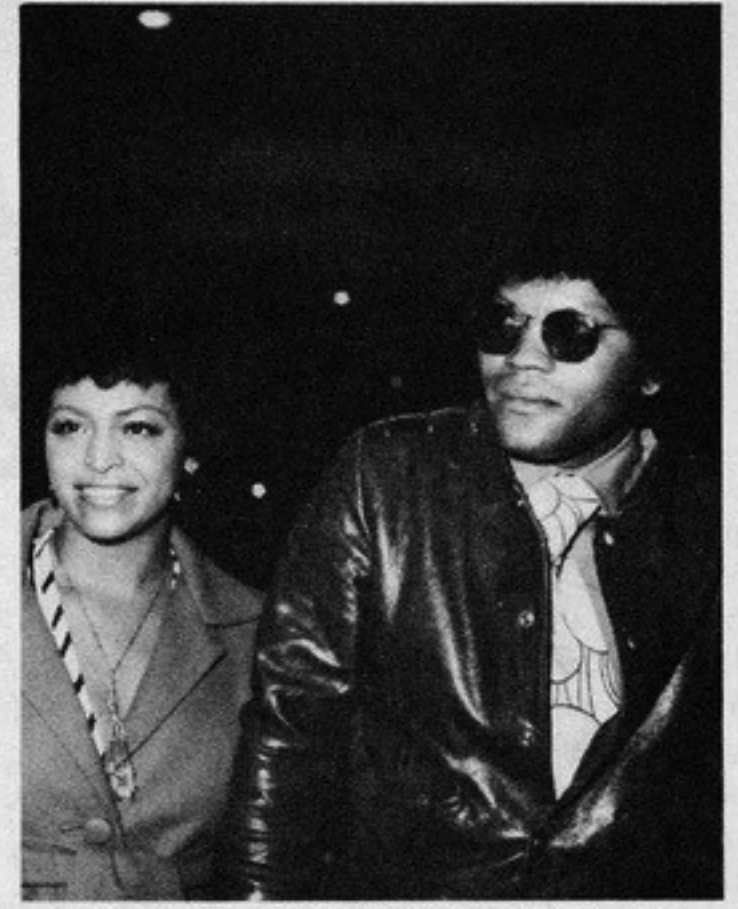
Clarence Williams and his wife, Gloria Foster, have a big night out together.