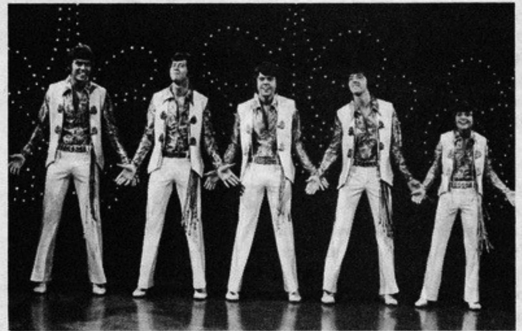
When The Osmond Brothers get on stage, things happen! Not only are they great singers, they have a fantastic dance routine going!

Hope you didn't miss this year's "Miss Teenage America" pageant, KAREN VALENTINE was the hostess—and with her around, it was more fun than ever!... Did you know that ROBERT FOXWORTH of "The Storefront" (please turn to page 64)