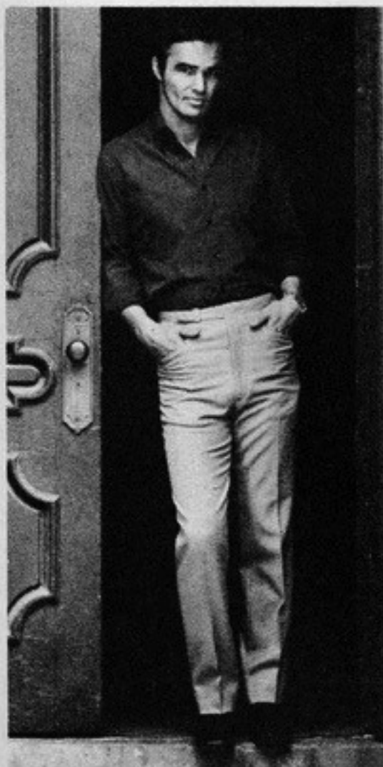
Burt Reynolds does his own stunt work—and lives to talk of it!