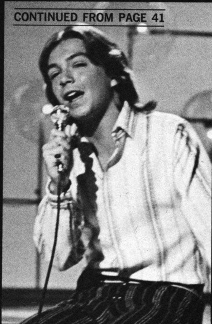
SEPT. '70: "I began making guest appearances on other TV shows too! Above, I'm singing 'I Think I Love You' on Bandstand!"