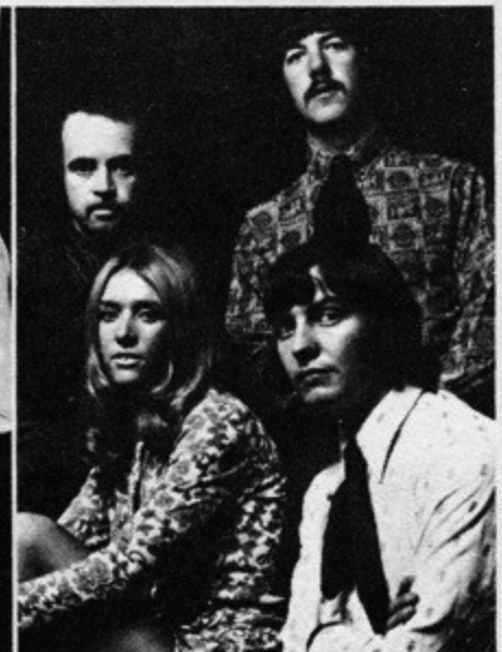
Middle Of The Road