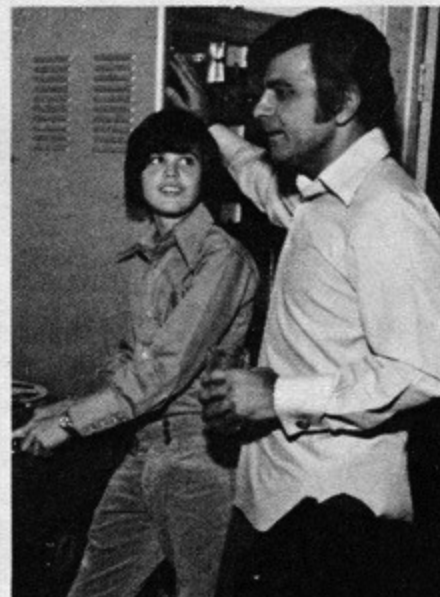
Donny & Casey

To celebrate his gold record for Sweet And Innocent , young DONNY OSMOND dropped by my studio to say "hi" and present me with a copy of his single record Go Away, Little Girl . Hope Donny gets yet another gold record for this newest MGM single of his! . . . And speaking of MGM Records, the MIKE CURB CONGREGATION is creating quite a stir not only with their hit single Burning Bridges and their LP Sweet Gingerbread Man , but also with their nightclub performance at the Landmark Hotel in Las Vegas . . . Say "hello" to MIDDLE OF THE ROAD, one of England's top groups, who just happen to have the number one hit there in their single record Chirpy Chirpy Cheep Cheep . The group records on RCA Records in America and will have an LP forthcoming shortly . . . Former CREEDENCE CLEARWATER member TOM FOGERTY had his first single released on Fantasy. It's called Goodbye Media Man . Meanwhile, CREEDENCE CLEARWATER—consisting of DOUG CLIFFORD, STU COOK and JOHN FOGERTY—have just released a groovy single called Sweet Hitchhiker .