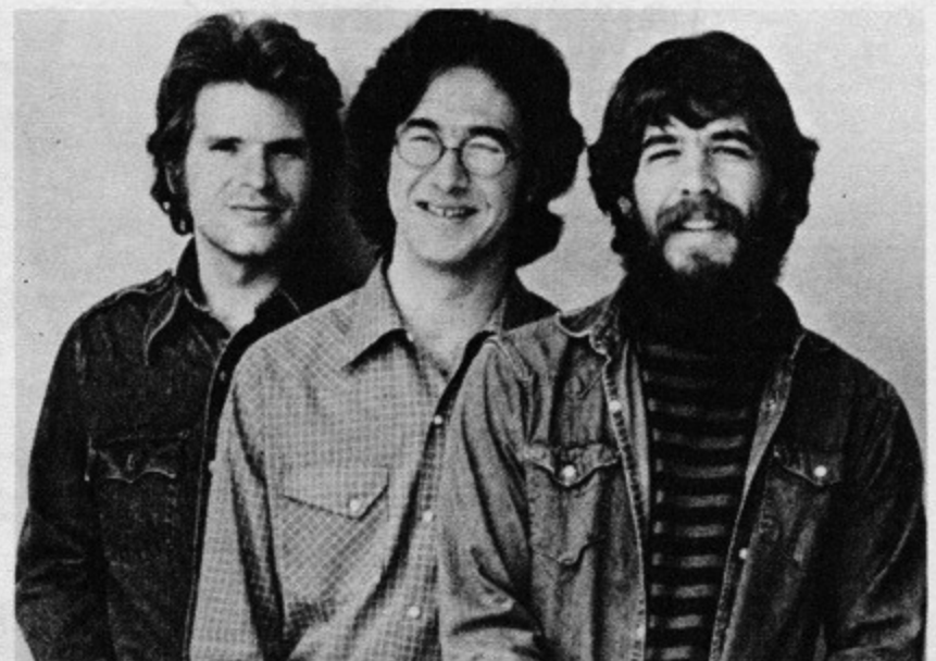
Creedence Clearwater Revival