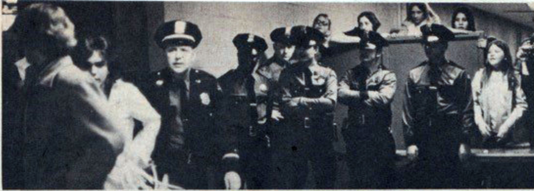
THE SECURITY GUARDS are everywhere and David hardly ever has an opportunity to say hi to fans.

Of course David isn't one to make a scene like the Stones were, so he just shrugged and said, "Ok, let's go." We all went back to the hotel and we were feeling pretty bad as well as hungry. Finally we stopped by the hotel coffee shop before going to our rooms. We had to get something into our stomachs!