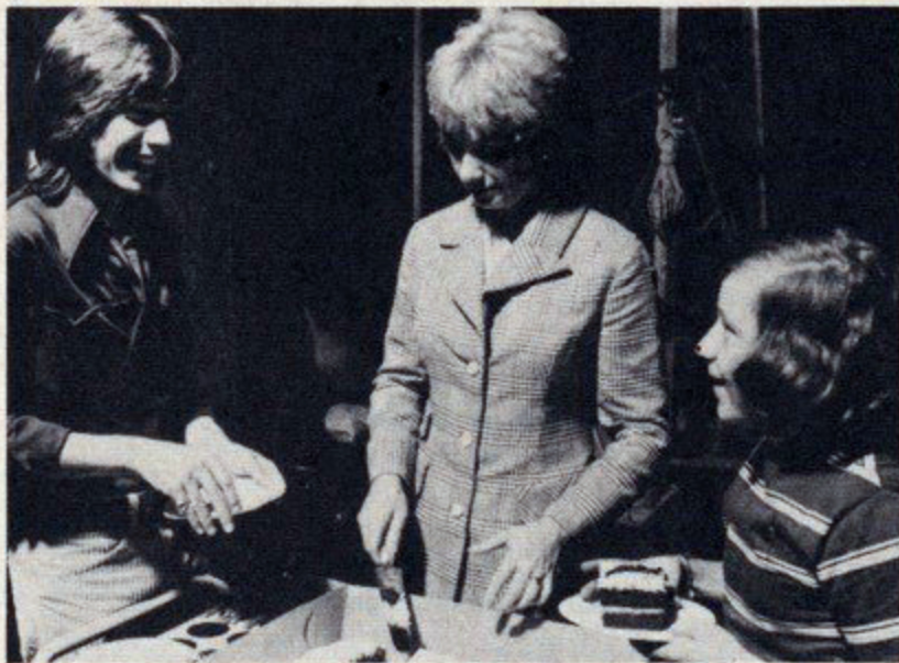
DANNY BONADUCE CELEBRATED his 12th birthday on Aug. 13 with a huge "Snoopy birthday cake. All had fun!

You don't have to worry about missing an issue either! Now Partridge Magazine is available by subscription and