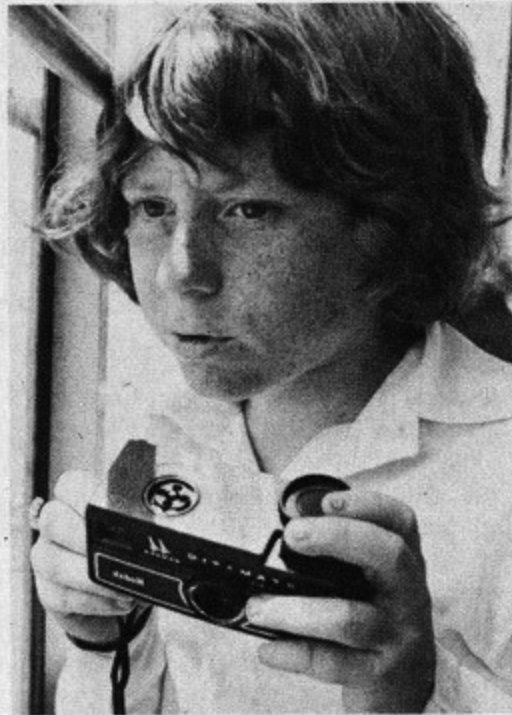
DANNY'S LATEST hobby is photography and he loves shooting pictures of all his Partridge buddies at work!

ocean, and we'd have to stop and look for it every couple of minutes! (Another problem with the tide was us trying to get around some of the rocks without getting soaked). Luckily, we always found the frisbee, but David was elected to run in the water every time, so by the time we got home, David was wringing wet!