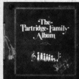
Their First Album! "THE PARTRIDGE FAMILY ALBUM" on BELL Stereo 6050