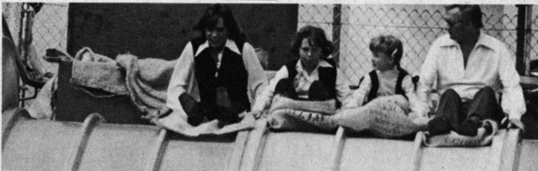
ONE MORE TIME! To get the scene just right during their filming of one show at Marineland of the Pacific, the Partridges had to ride down the super-slide several times. But no one heard any complaints from them!