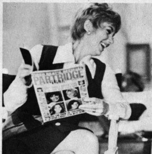
FUN FOR EVERYONE! That's what it's like reading TiGER BEAT'S Official Partridge Family Mag. Ask Shirley!