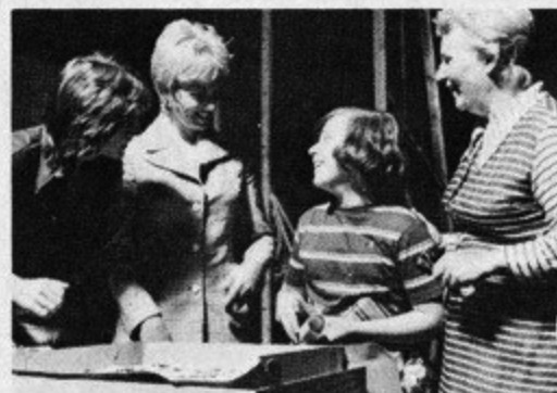
Danny's birthday was a gas!