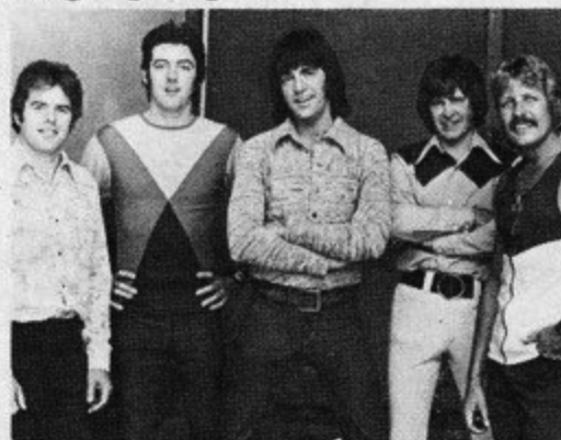
Raiders are still a group!