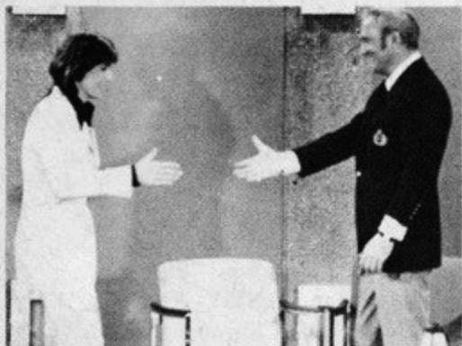
Jack welcomes his son to the show.

When JACK CASSIDY guest-hosted for Merv Griffin in August, his special guest was his son DAVID . What was extra-special about the show was that JACK and DAVID didn't rehearse anything they were going to talk about so when his dad asked him point-blank questions like “Did coming from a divorced home hurt you?” DAVID answered with complete honesty! He also performed the number “Danny Boy” for the studio and home audience.