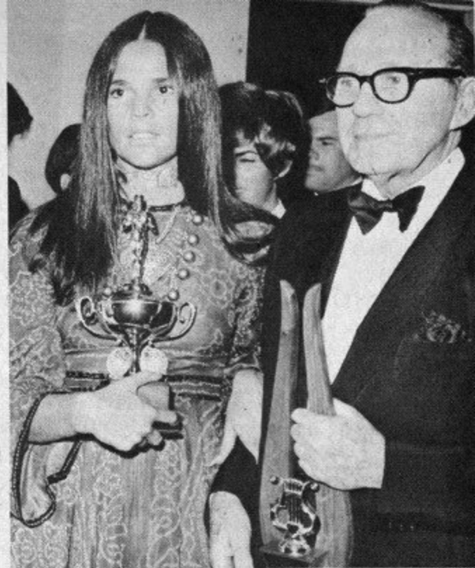
Ali MacGraw said her second biggest thrill was meeting Jack Benny, who picked up a violin and, surprising everyone, played a solo to celebrate.