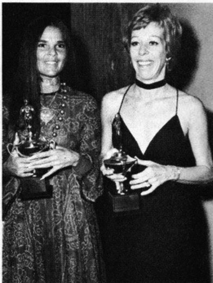
Ali MacGraw and Carol Burnett were proud recipients of Oscarette Awards. Lucky gals.