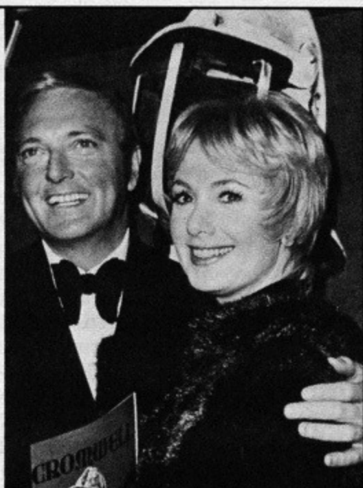
Despite constant break-up rumors, JACK CASSIDY and wife SHIRLEY seem to be very happy these days.