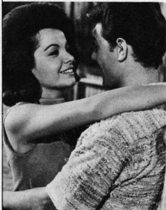
ANNETTE FUNICELLO is thinking about getting back into action as an actress again. On the left she's with her co-star FRANKIE AVALON in one of many "Beach Party" pix she made years ago. On the right with her children.