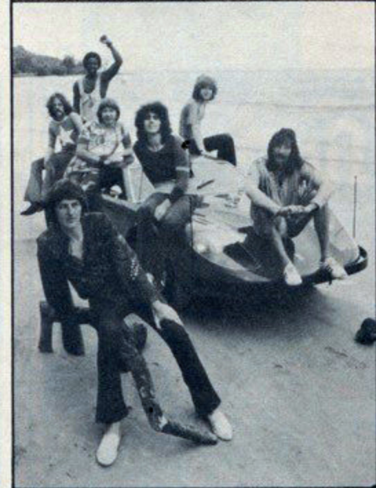
THREE DOG NIGHT