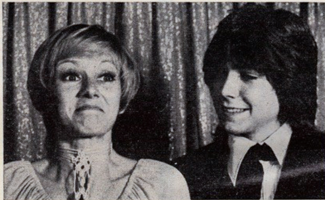
Sandy Duncan's just bubbling over her fall TV show & Instant Stardom . Partridge Family's David Cassidy, 1970's Instant Star , knows how scary success can be!