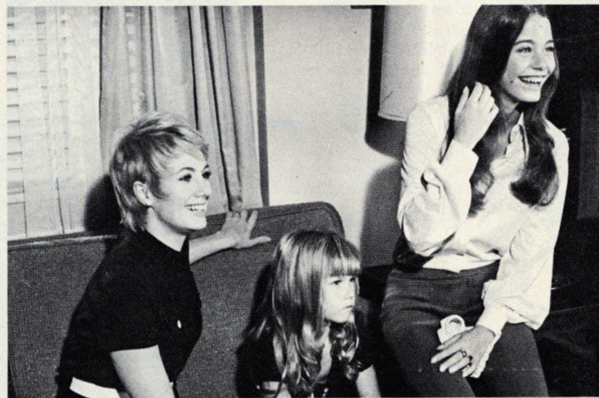
THE CO-STARS OF "The Partridge Family" get along just like a real family! The Partridge women laugh as they watch David do the shower scene above.