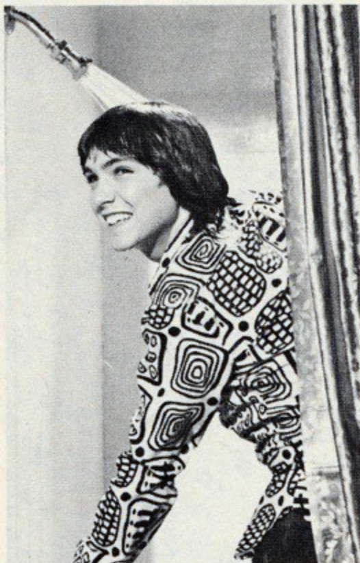
WHATEVER THE SCRIPT calls for has to be done! David just grins and bears it! Burrrrr!

Shirley: "One thing I'll never forget as long as I live was learning to drive the Partridge bus. I had so much trouble with it. Next year