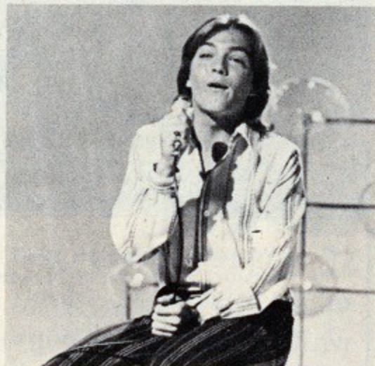
"HERE I AM introducing 'I Think I Love You' on American Bandstand, hoping that the audience liked it!"