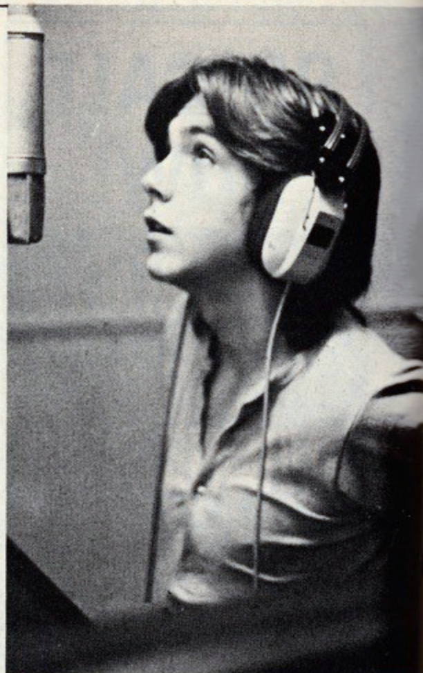
"I HAD TO CHOOSE at least one pic of me recording, there isn't much I like better than doing an album!"

Editor's Note: We think it's safe to say that we have as many pictures of David Cassidy as anybody else, and probably more! David's very first shooting for any publication was for FaVE, and in the almost two years since then our cameras have been with him on the Partridge set and as far away as Hawaii! Even so, David was amazed at the number of photographs he had to go through when we asked him to choose his favorites! It took him almost a whole day, but he loved the memories they brought back! Let him tell you about them!