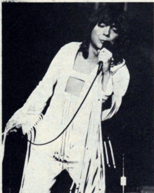
"MY MARCH CONCERT in Seattle (yes, another first!) where I really found out how singing live to you is!"