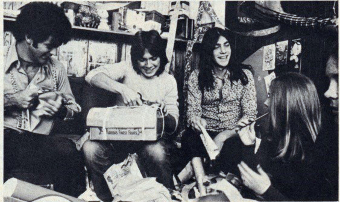
"TURNING 21 IN APRIL of this year was made super-special for me when the editors of TIGER BEAT, T.B. SPEC, FaVE and PARTRIDGE FAMILY magazines threw a surprise party for me! It was my all-time best birthday!"