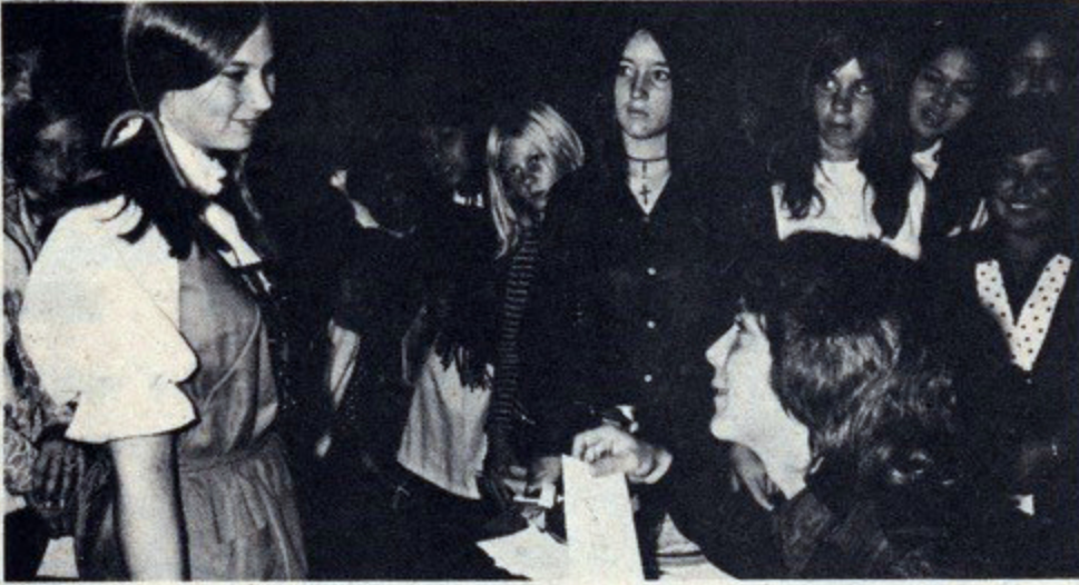
"YOU PROBABLY HAVE NOTICED by now that most of my favorite photos involve 'firsts' in my life. My autograph session at a department store in October '70 was one of these and I loved it!"