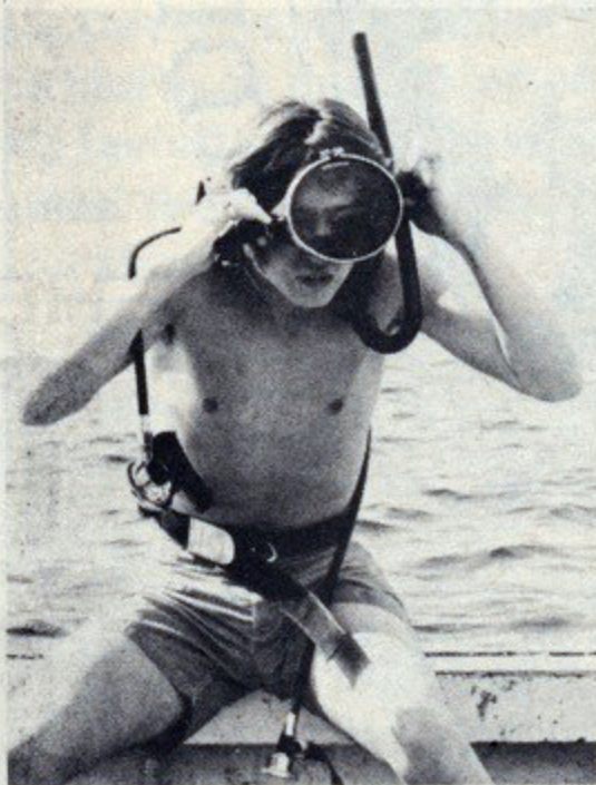
"ON THE SAME trip we got a lot of skin diving in. We had just earned our certificates and it was really exciting!"