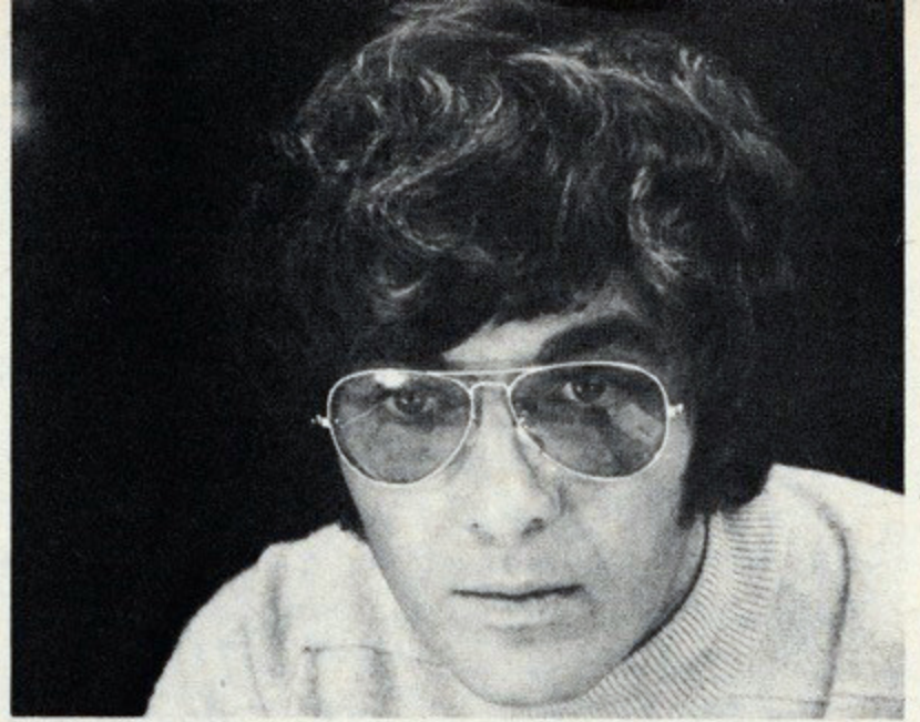
THE YEAR WAS 1970 and the month was June when Michael Cole revealed in an exclusive Tiger Beat interview that he is looking for the right girl so he can settle down. Do you think you might be her? Michael says that just being an individual is all that's required!