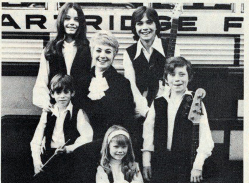
EVER HEAR OF such a thing as the ideal family? Well, the Partridges probably came closest to it! September 1970 marked the debut of their show and audiences ranging in age from 6-60 seem to find it entertaining! The series is a first for David Cassidy and all the kids.