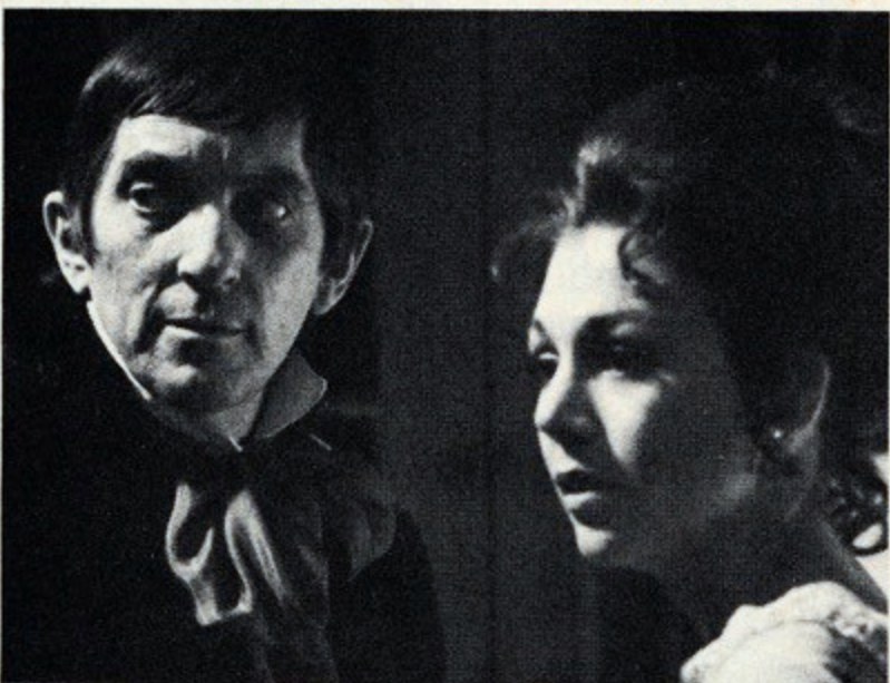
EEEEK! WHAT'S THAT before you? A ghost? Well, it just might be, if you made it on down to the "Dark Shadows" movie! For the first time the Dark Shadows gang did a special flick for those who dig the movie scene... and the sound of screams, among other things!