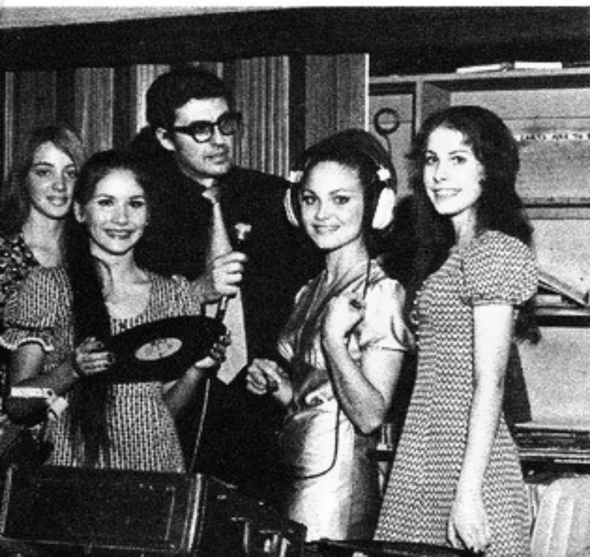
Desi on Mod Squad