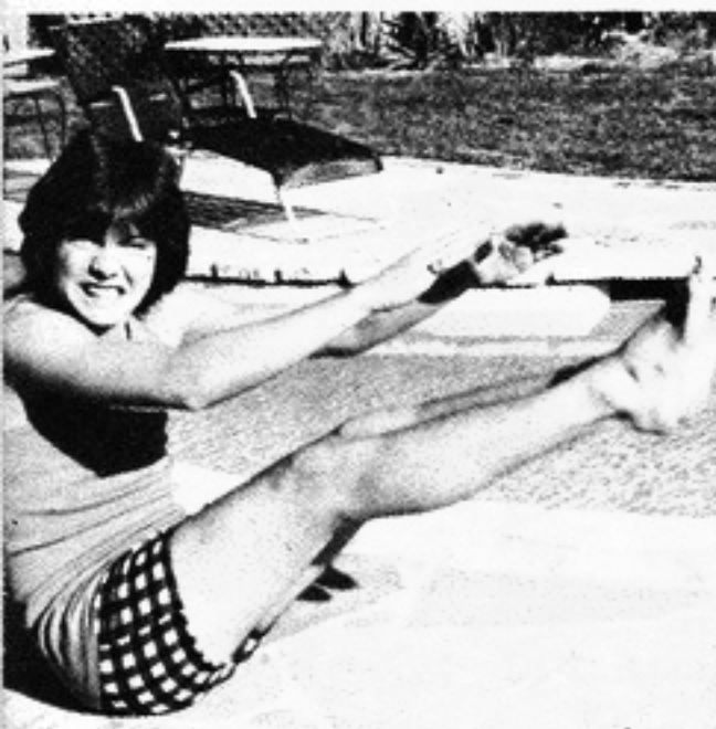
A. David Cassidy

WHEW—that sure was a tuff test!! Well, now's your chance to see how you did! Here are the correct answers. You say you got all four right?—Outasite!!!