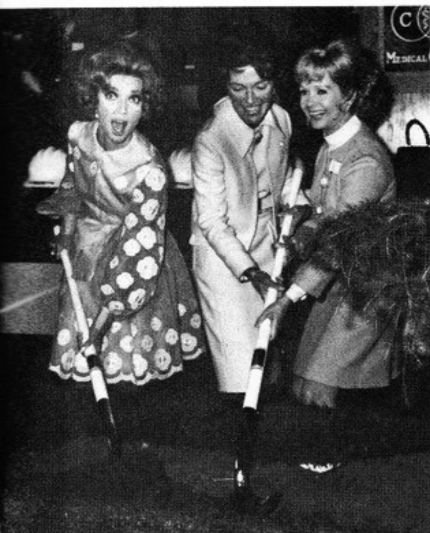
Ruta Lee, Mrs. Ronald Reagan and Debbie Reynolds happily turned out for the groundbreaking ceremony for the Thalian's Community Mental Health Center. They've worked long and hard for this.