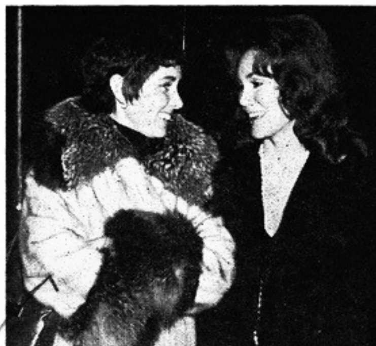
Elanore Donahue, the little girl you watched grow up on "Father Knows Best", chats with Mary Ann Mobley.

On the show, Connie was proudly telling me how four-year-old Jolie (by Eddie Fisher ) was "a genius." And how she wouldn't marry anyone in show biz again. Tony told me how he hoped "The Persuaders" would get picked up