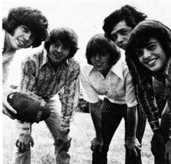
Osmonds broke attendance records!

Watch for SUZANNE CROUGH to appear in an upcoming Kentucky Fried Chicken commercial... MARK LIND- SAY recently returned from a short vacation in Mexico. Searching for furnishings for his house the only thing he returned with was a statue of a rabbit!... Hope you didn't miss CHAD EVERETT'S singing debut on the "Sonny and Cher Show" on January 31st. CHAD really showed off another of his versatile talents... Did you see the BRADY BUNCH kids on the "Ed Sullivan Special?" If you thought they were groovy as an act, you may be able to see them live soon—they're putting together a road show and hope to be touring by spring!... During their appearances at the Diplomat Hotel in Hollywood, Fla., THE OSMONDS broke the attendance record set by ENGLEBERT HUMPERDINCK . They brought in over 17,000 people in 10 days!