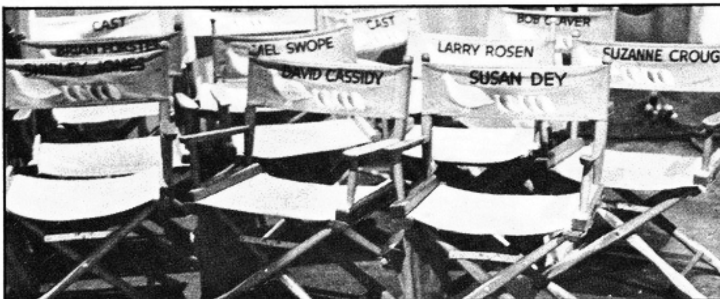
THE PARTRIDGE CHAIRS gather dust while everyone is on a vacation!