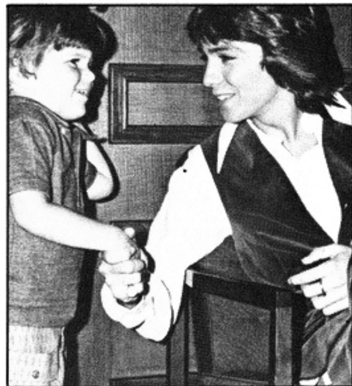
CHILDREN ARE SPECIAL