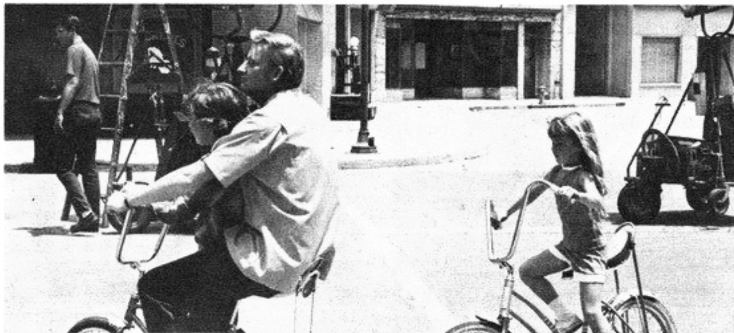
WHO IS THAT GIVING the red-haired dynamo of the PF set a lift? Could it be ME? I must be getting soft or I really like the kid! Maybe it's both!