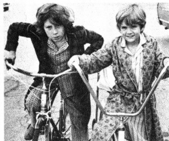
PF KIDS and bikes go together like bread and butter. Just try to borrow their bikes—it's no go for anyone!