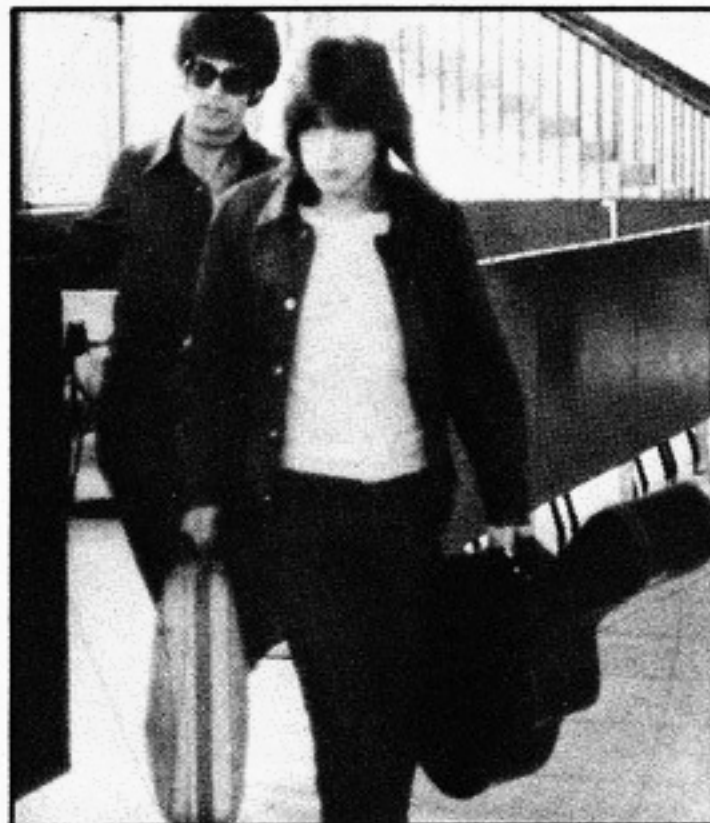
Rushing for concert gigs