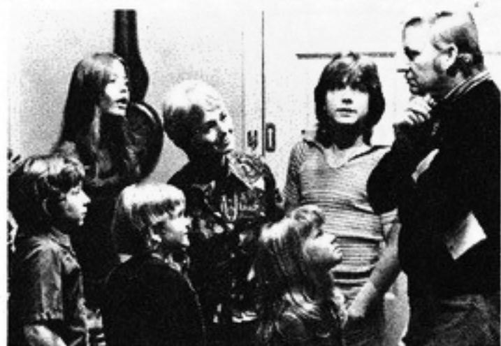
Together again, for the 3rd season!

It's so exciting thinking about seeing all the PARTRIDGES at work again, that the twenty minute ride from home seems like hours. You can feel the butterflies fluttering and fluttering in your stomach as we approach the weatherbeaten sign, that reads "Columbia Ranch!"