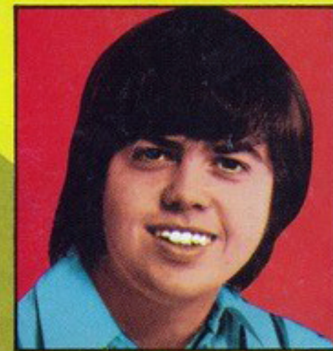
OSMONDS: "WE'VE GOT NO CHOICE!"