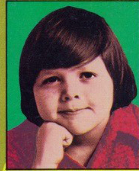
IS JIMMY GOING STEADY?