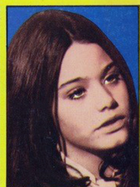
SUSAN: HEADED FOR HEARTBREAK