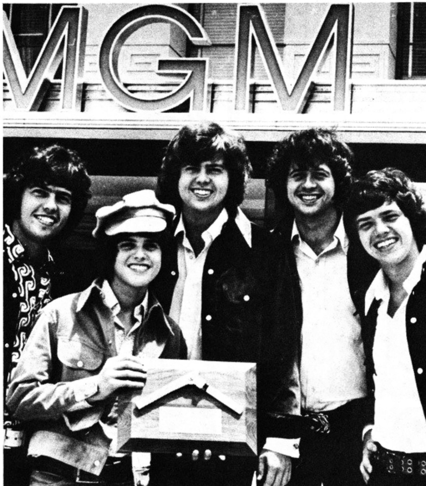
The Osmonds accept an award from the United Cerebral Palsy Association for their assistance.