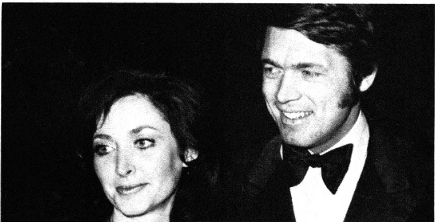
The happiest couple in Hollywood is Chad and his devoted wife Shelby Grant.

LEE MONTGOMERY in the latter. Lee is a muchly talented actor at the ripe old age of eleven. When he isn't working, he's a beach nut who swims and gets a great tan and surfs and all that, in between collecting coins and playing baseball and handball. If you're already a fan of Lee's, or just becoming one, his next movie is "Pete and Tillie," where he plays the son of WALTER MATTHAU and CAROL BURNETT . It's coming out soon, so don't miss it!