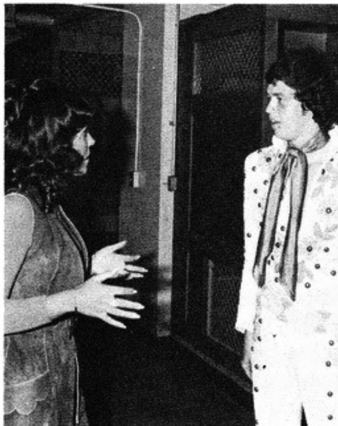
THE OSMONDS' CONCERT in Anaheim, Calif., was terrific! The Carpenters thought so too, and after the show Karen visited backstage with Jay! The Osmonds and the Carpenters spend time together with their music!

Then I had an idea! Maybe Michael could be our secret Hawaiian investigator! Maybe he could let the readers of Tiger Beat Magazine and FaVE, too, in on all the excitement of Hawaii! I was a bit worried about asking