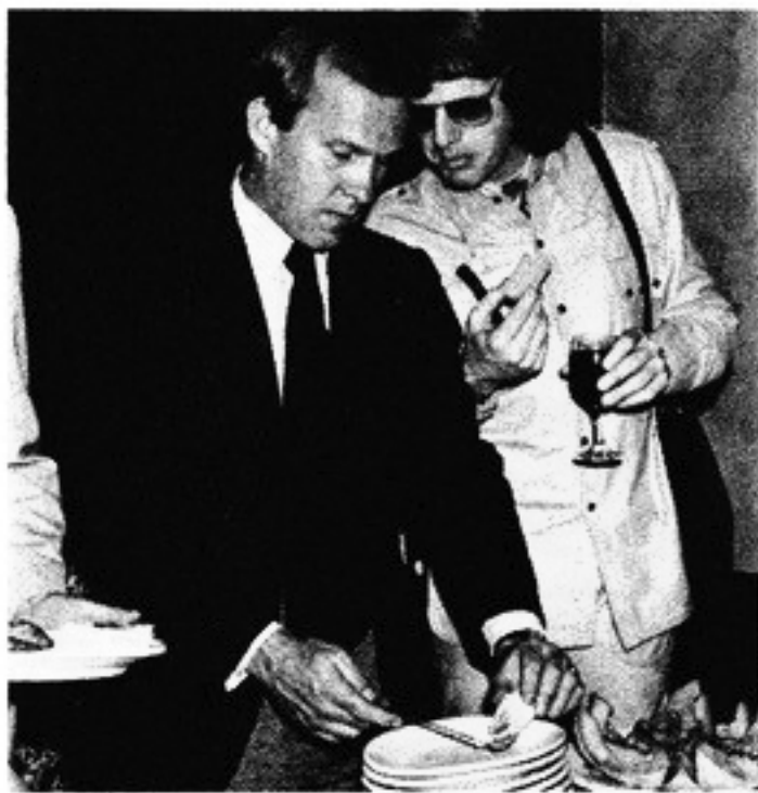
TOMMY Smothers enjoys food at "in" Strip eatery after "Lenny" premiere.