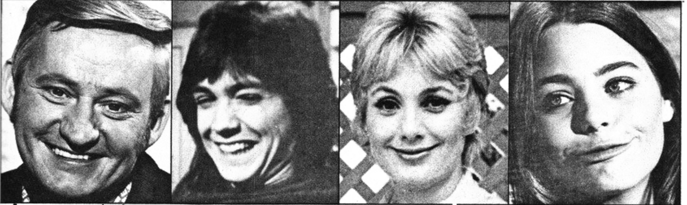
Look Mom! No Cavities!