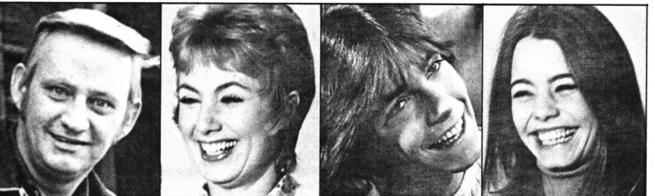
Ballerina costume? For me? No way!!