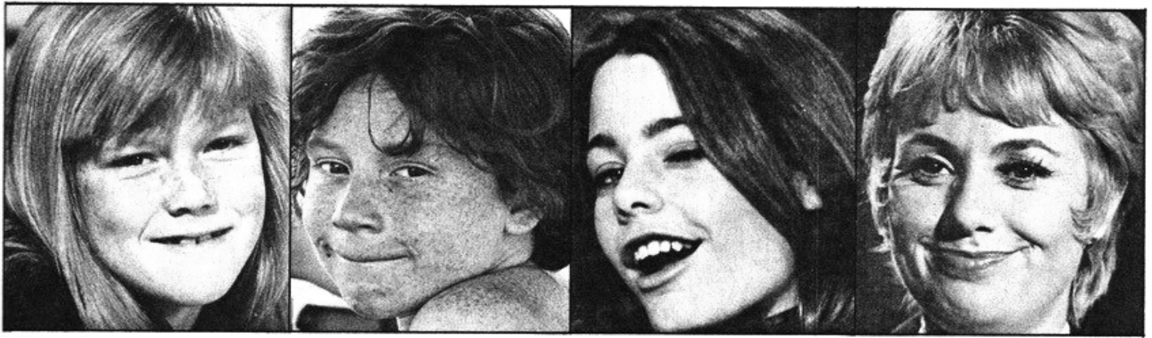
What do you mean, I'm "cute!?" - huh?