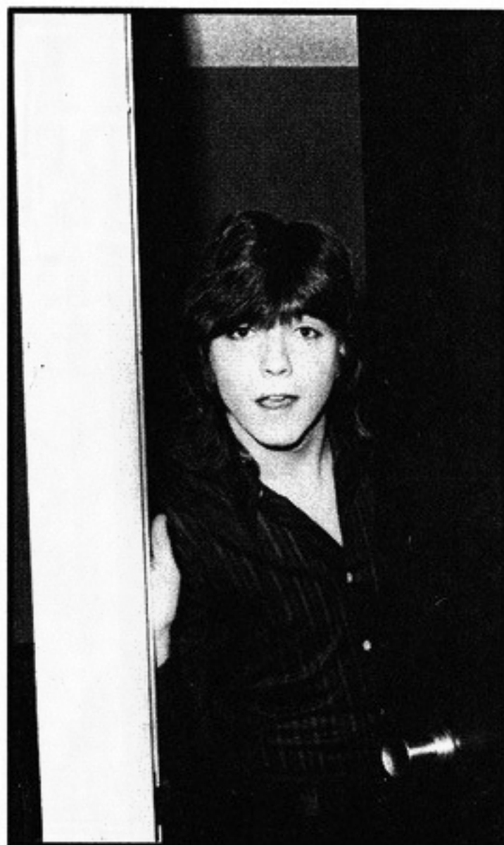
CASSIDY FAN CLUB

A devoted Fan of David's Pittsburgh, Penn.