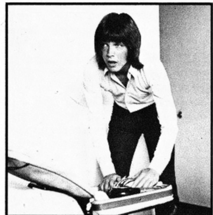
HURRIED packing is part of the tours!

Another frequent problem on the road is the mysterious case of the disappearing instruments. How it happens, no one knows, but three times that I can remem-