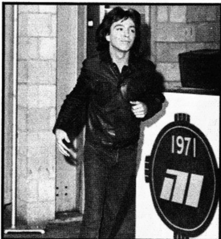
RUSHING TO begin another concert!

Then there are the little problems, like weather and clothes. When we take off from Los Angeles International Airport in the middle of, say, February, we're going to be in about five different kinds of climate in a week! That means one or two things—either you pack every kind of clothing in the world, or you suffer with clothes that are always just a little too hot—or a little too cold! Since we don't have much room for baggage, what with the instruments, "amps," costumes, and ev-