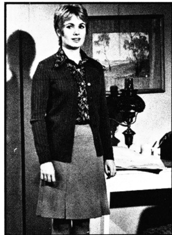
A VISIT FROM SHIRLEY!

Shirley was very flattered by your sweet invitation but she is going to be working hard on the Partridge Family all this fall.