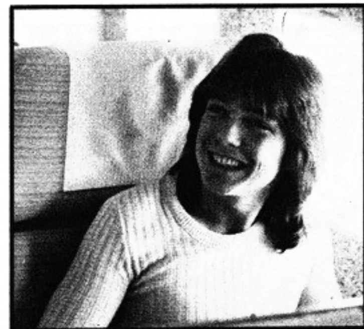
SEE THAT SINCERE SMILE?