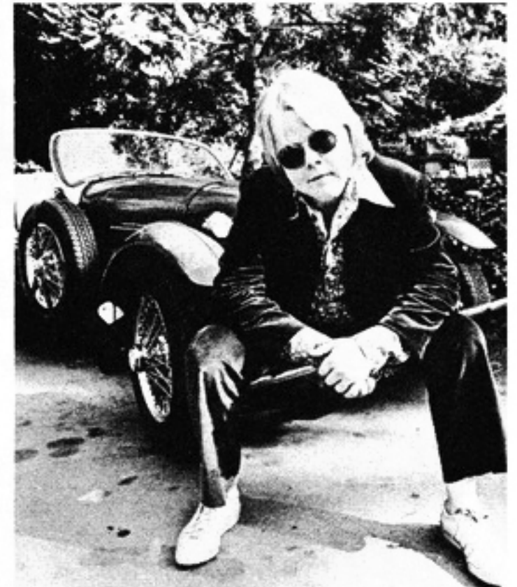
SONGWRITER PAUL WILLIAMS, who wrote "We've Only Just Begun" by the Carpenters and "Just An Old Fashioned Love Song" by Three Dog Night has just released his own album on A & M.