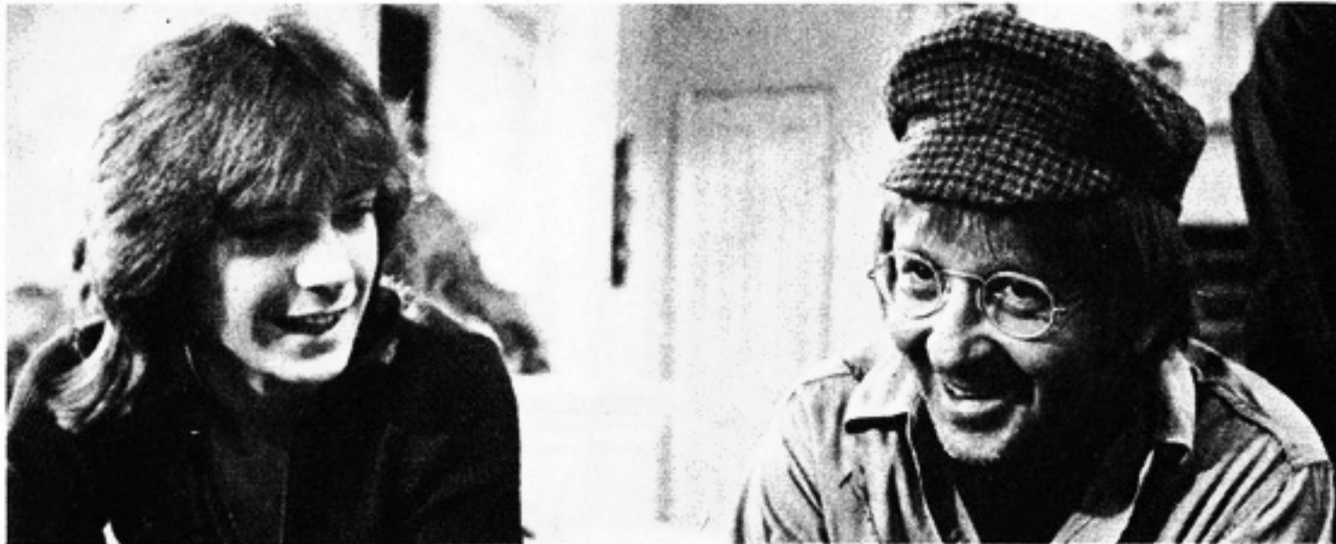
DAVID AND PARTRIDGE guest-star Arte Johnson take out some time to rap!

DANNY is walking with you and he explains, "We need all this stuff for this week's show. The Partridge's go to the Art Museum," he stops and looks at a modern art picture. "I drew something like this last week and my teacher failed me," he laughs, "but I bet they'd hang it up at the Art Museum."