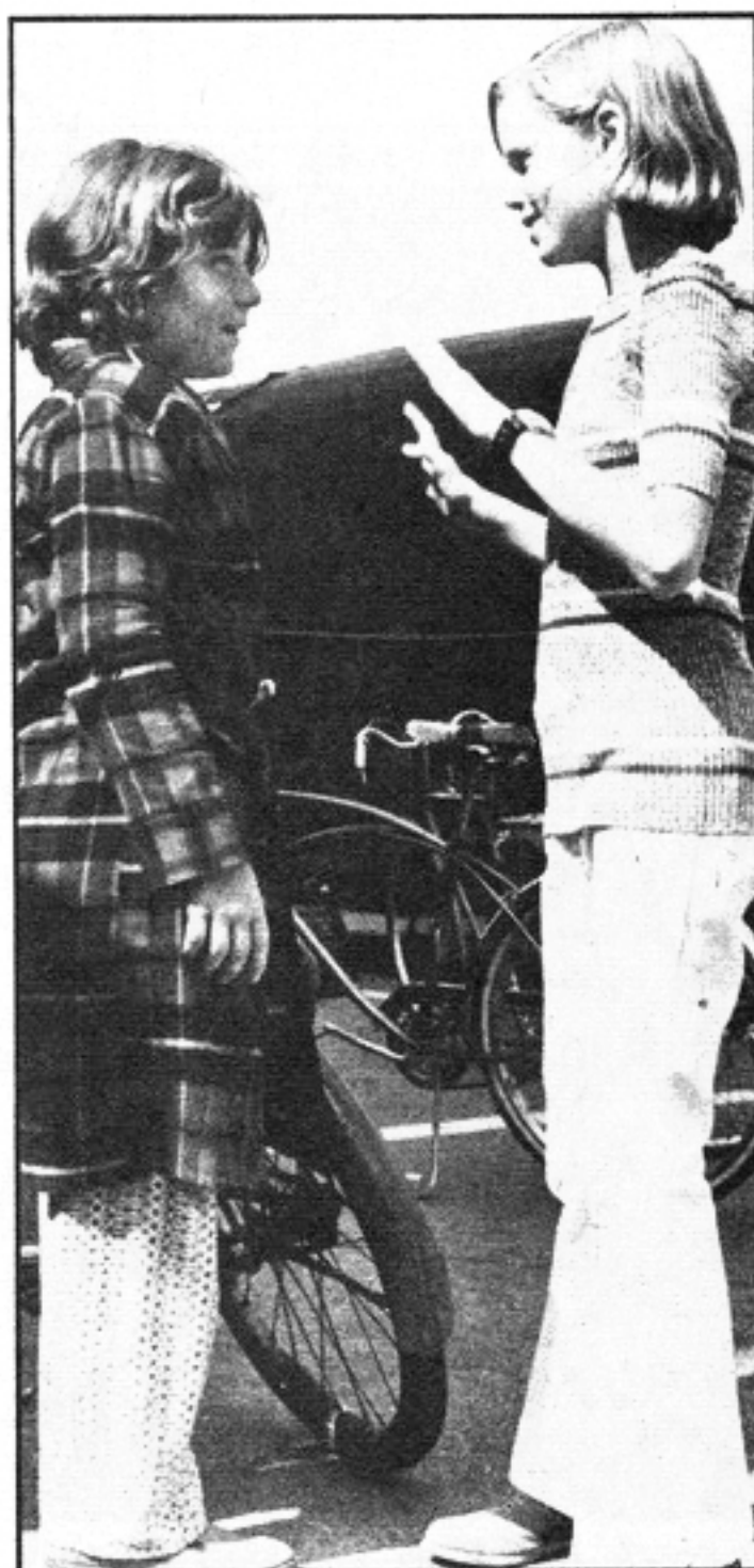
DANNY AND SUSAN NEHER

Q. I've heard so much talk about Danny Bonaduce and Susan Neher, I don't know where the truth begins and where the rumors start! Please tell me if they're really going together or if they're just friends? I know I can rely on you for the truth!