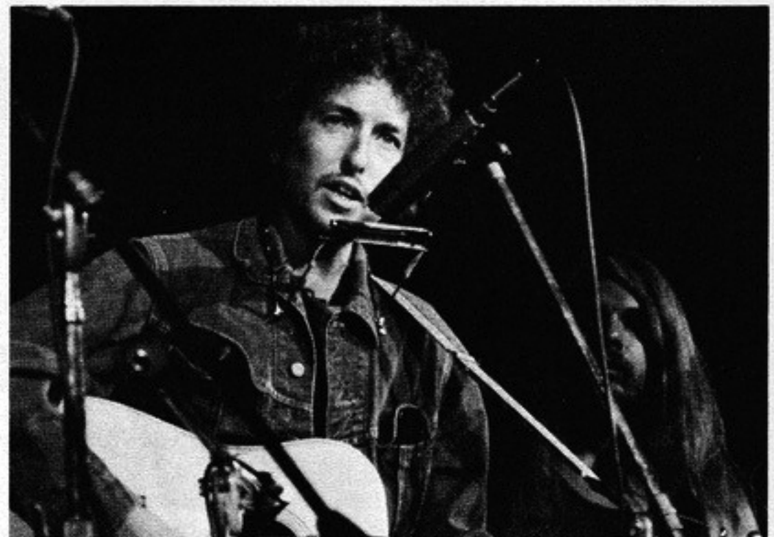
Bob Dylan at Bengla Desh benefit