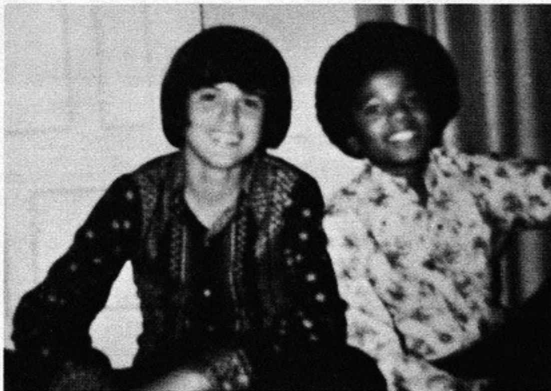
Donny & Michael

A special thanks to Beatles George Harrison and Ringo Starr and to the one and only Bob Dylan for making George's concert for the benefit of the refugees of Bengla Desh (East Pakistan) such a huge financial success. Because of the work of George and Bob—and many others—these deprived and victimized people will be receiving $255,971, to be used to provide sorely-needed food, medicine and other services. The benefit funds, which are being administered by the United Nations, will be increased (even more!) after profits come in from a TV spectacular of the Harrison-Dylan Madison Square Garden Concert (to be aired December 4 on CBS-TV) and from the sales of the LP made of this concert, which is entitled Concert For Bengla Desh and is on the Apple label, available at your record store now.